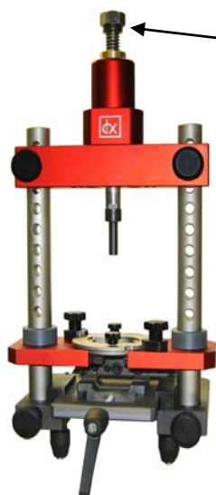
CROSS REFERENCE BETWEEN LOAD (KN) AND DYNAMOMETRIC TORQUE (NM)

Example how to use the press not only for unscrewing and tightening, but also as support on disassembly and reassembly.