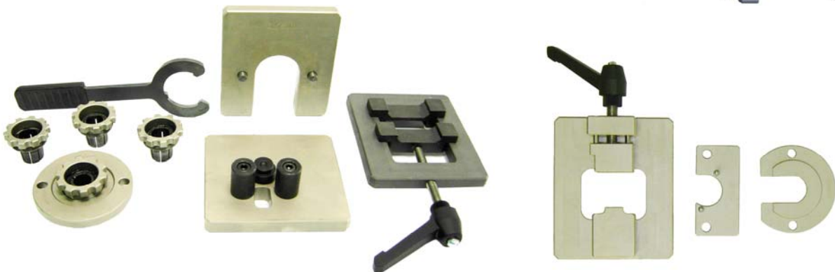
Specia tools and plates to be used on “Giuditta” press to hold the varous injectors types.