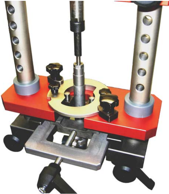
Example of a Bosch Common Rail injector application on Giuditta press.

The “GIUDITTA” press device has been developed with the purpose to save the integrity of all components that, even being a very precise unit and critical working functions, they must be disassembled and reassembled with specific high torque values.